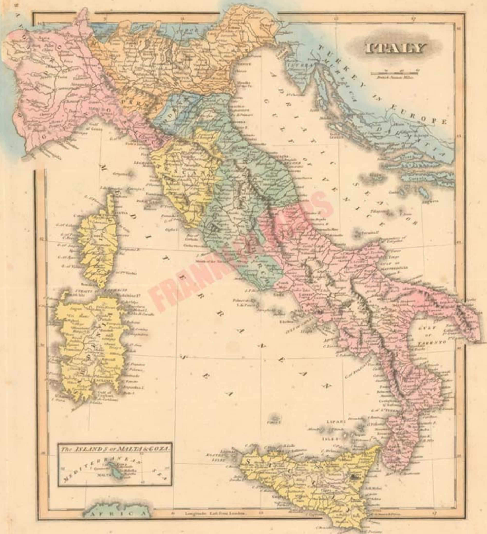
The ISLANDS of MALTA & GOZA.